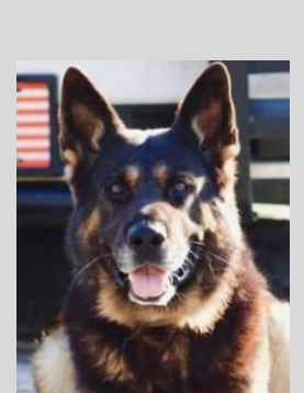
K9 Archer Madison County Sheriff's Office, FL EOW: Friday, July 5, 2024